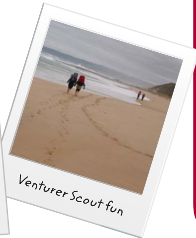
Venturer Scout fun