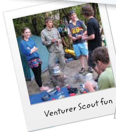
Venturer Scout fun

"Venturers provides fun, diverse activities that my friends can hardly believe I do!"