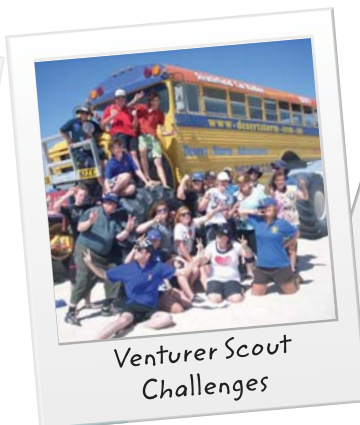
Venturer Scout Challenges