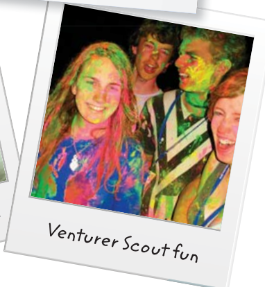
Venturer Scout fun